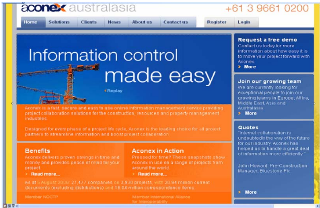
Figure 3 Aconex introductory webpage