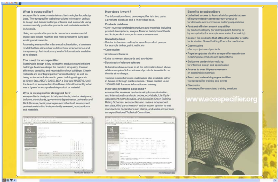
Figure 2 Ecospecifier

By 2004, the EcoSpecifier website had received over 100,000 visits and feedback from industry has shown that the site is the industry's leading resource on environmentally preferable materials. Currently, a commercial database of over 1000 building products exists that has been independently vetted against sustainability criteria, and provides guidance on the environmental impact of commonly available building products.