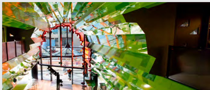
Swanston Academic Building