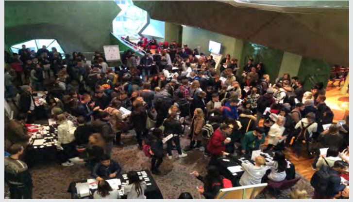
RMIT student orientation