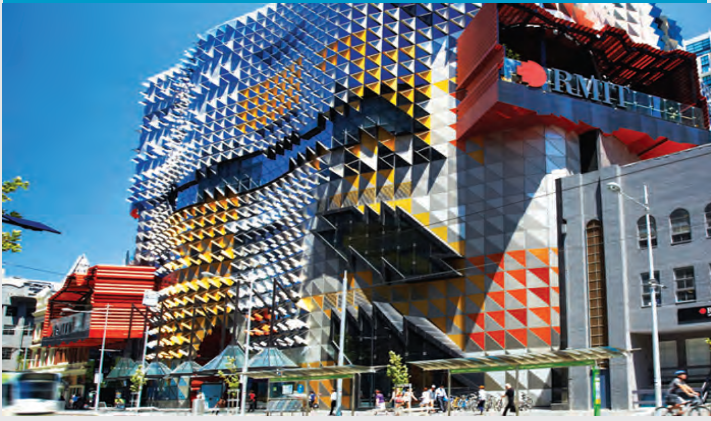
Swanston Academic Building