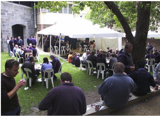
The sun finally shines on the over 80 PS people that attended the Christmas Function