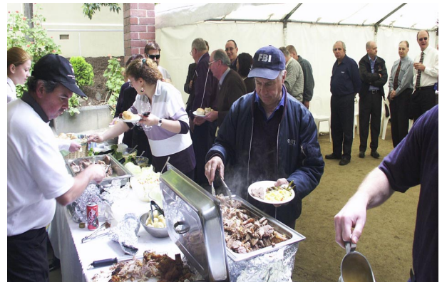
The self service line moves quickly through the hot and cold buffet and then back to demolish the sweets.