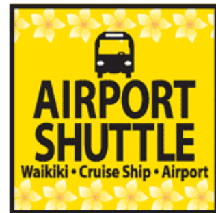
Shuttle Stop Sign