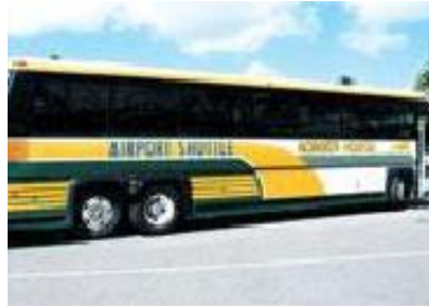
Shuttle bus fleet type

There is no free shuttle bus service between Hyatt Regency or Sheraton Princess Kaiulani . However, there are several paid shuttle bus services between these hotels and Honolulu International Airport. One of the oldest Waikiki - Honolulu Airport shuttle services is operated by Robert Hawaii which is authorised by the State of Hawaii. The shuttle bus takes about 30 minutes to reach the Waikiki area from the airport and they drop passengers off at their specific hotel. The shuttle bus service is operated round the clock (24 hours a day). No reservation is required for shuttle service from Honolulu International Airport to major hotels in Waikiki area.