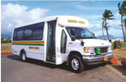
Shuttle bus fleet type